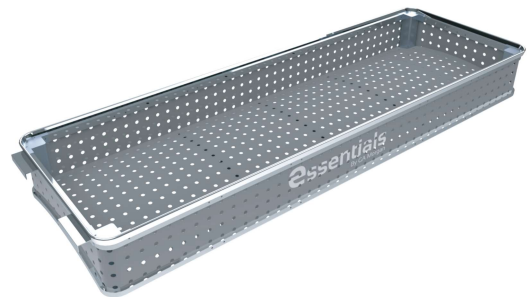
Perforated light weight, rugged fabric relaxing tray

GA MORGAN DYNAMICS PVT. LTD. Cutting Room Automation